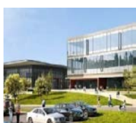
New buildings on the KU campus horizon