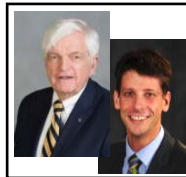
Alumni in the News